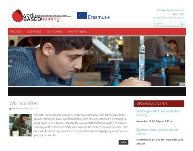
Project website: www.workbasedtraining.eu

First of all, the partnership was initiated in order to create a forum of pedagogues and responsibles to exchange ideas and expertise on workbased training issues.