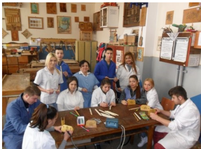
Young students at Grigore Moisil Vocational High School, Romania