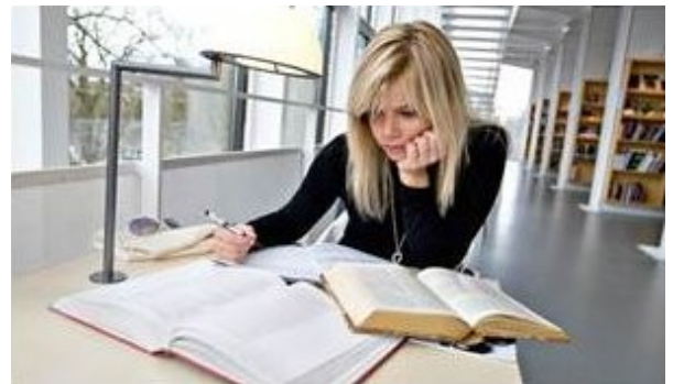
Young learner at CFL, Sweden

ter with the successful transition from school to work. But the national transition systems differ from country to country. Furthermore, regardless the national institutional setting may be, the same challenge has to be faced everywhere: how to combine theory learning and practice training efficiently in order to produce sustainable learning success with disadvantaged young people.